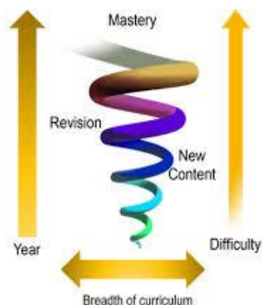
Diagram edited from: Spiral Curriculum; Jerome Bruner

The spiral approach to curriculum has three key principles: